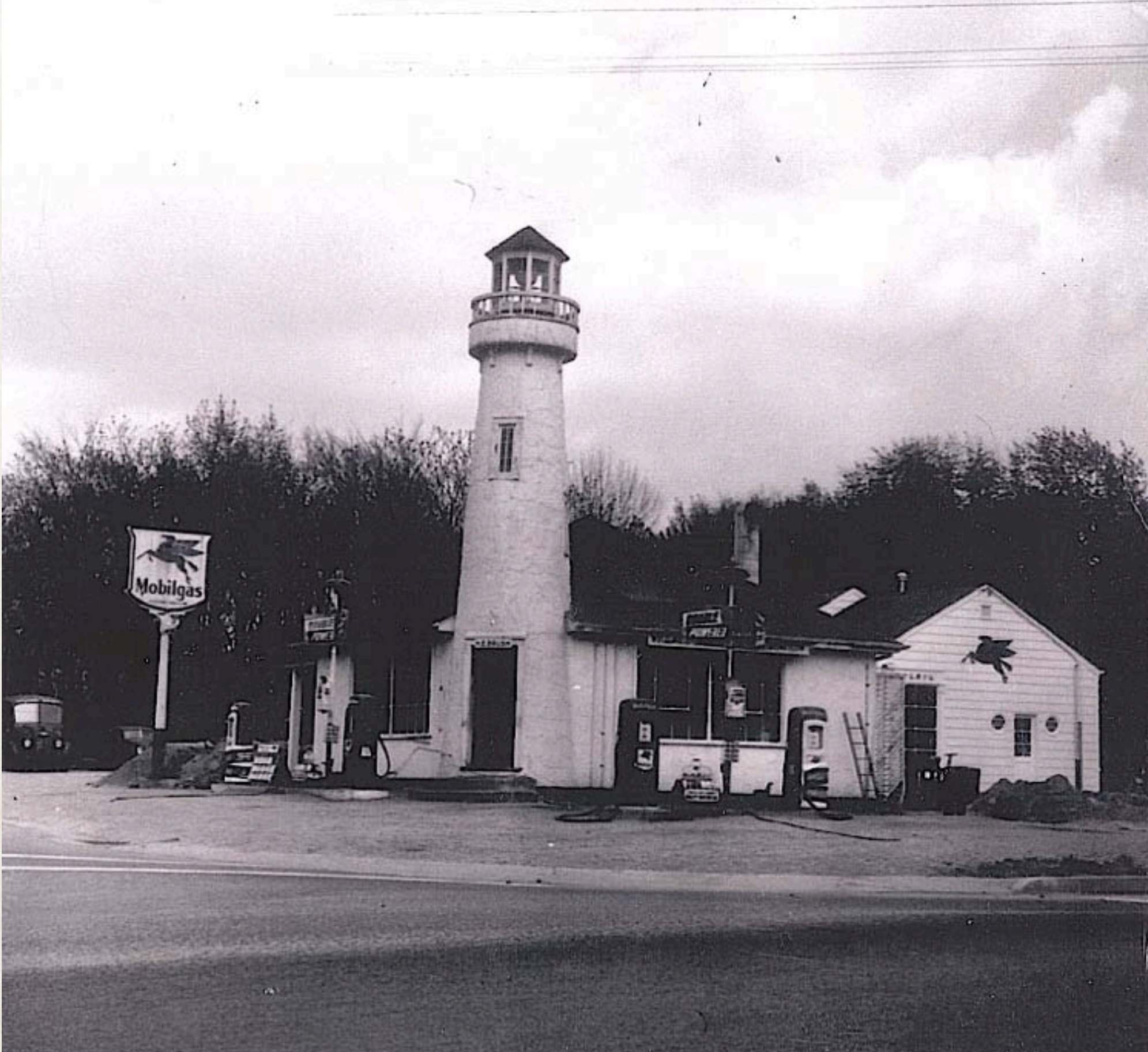
Gas station lighthouse circa around 1948 which was torn down for the current mobile gas station that is abandoned on the corner of Park and Main Street