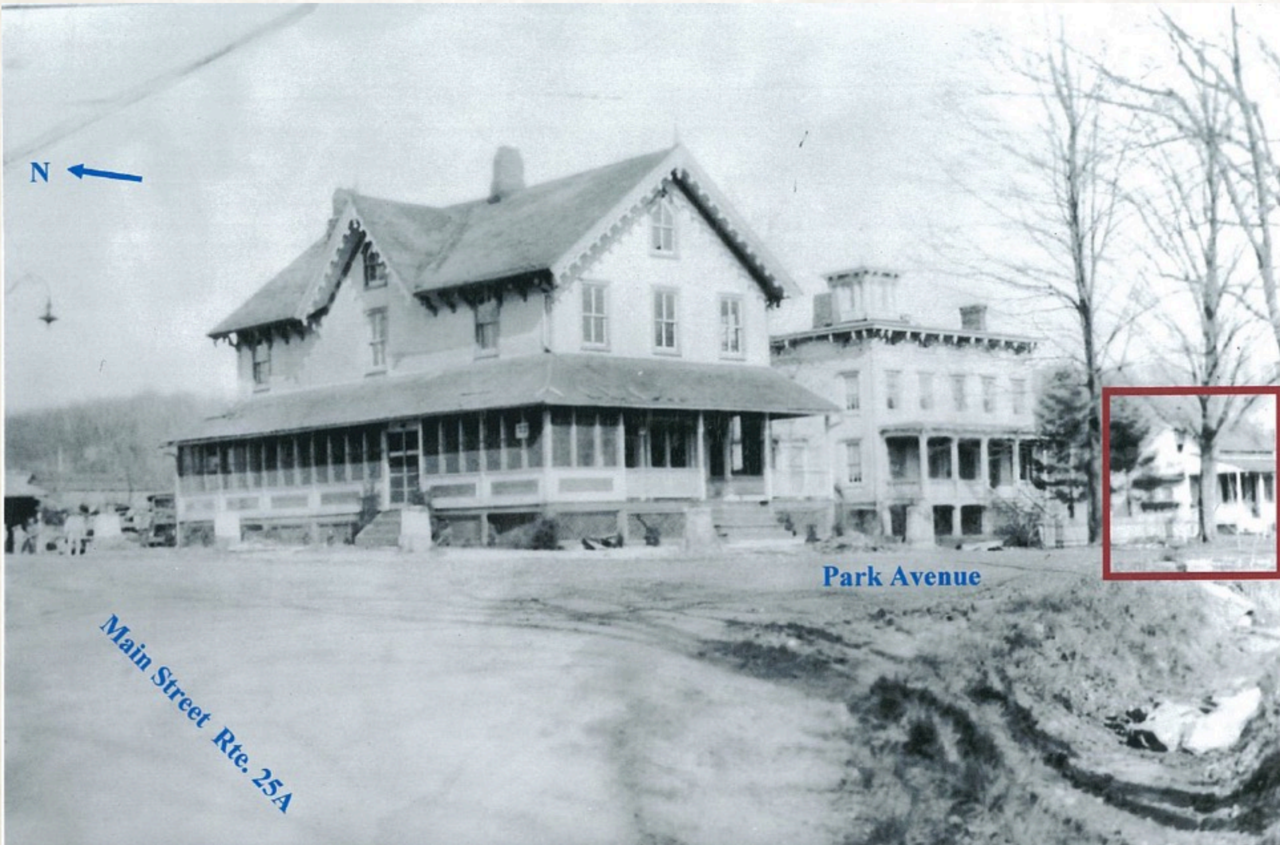
The Hotel and store, the Woodhull House, and the small house which is the Park Avenue Deli after Platts Tavern was gone.