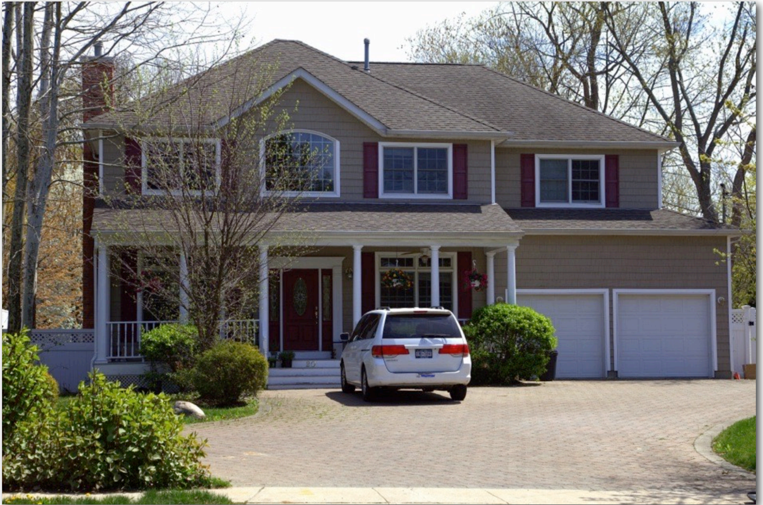
20 Main Street - This house is adjacent to Platts's Park Avenue