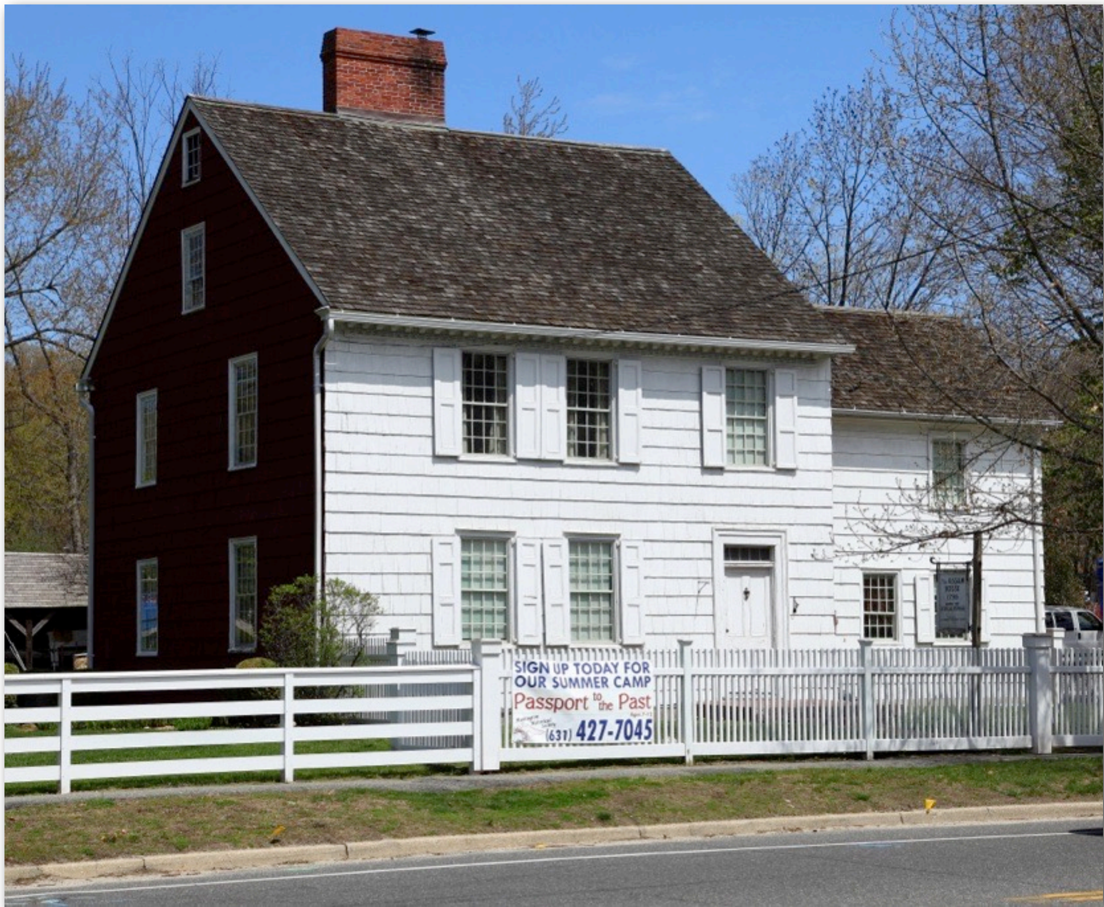
KISSAM HOUSE - Corner of Park Avenue and Woodhull - Aprox. 34' height