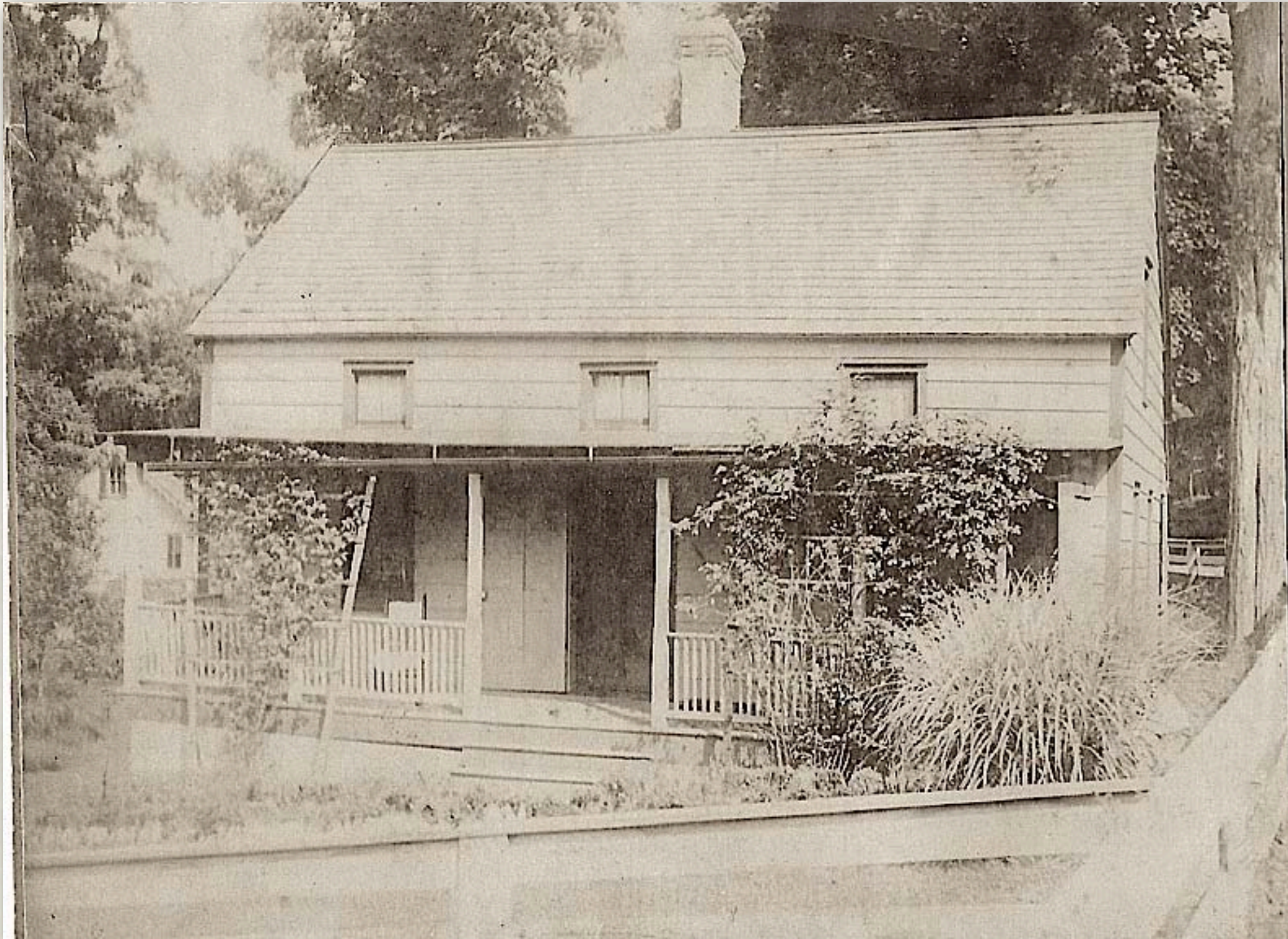
One of the earliest buildings constructed by the first generation of settlers was Platt's Tavern (c.1650) at the corner of present-day Park Avenue and Main Street. The tavern served a variety of functions as a local meeting place, inn, and auction house. President George Washington dined there with the town's dignitaries on April 23, 1790 during his tour of Long Island.