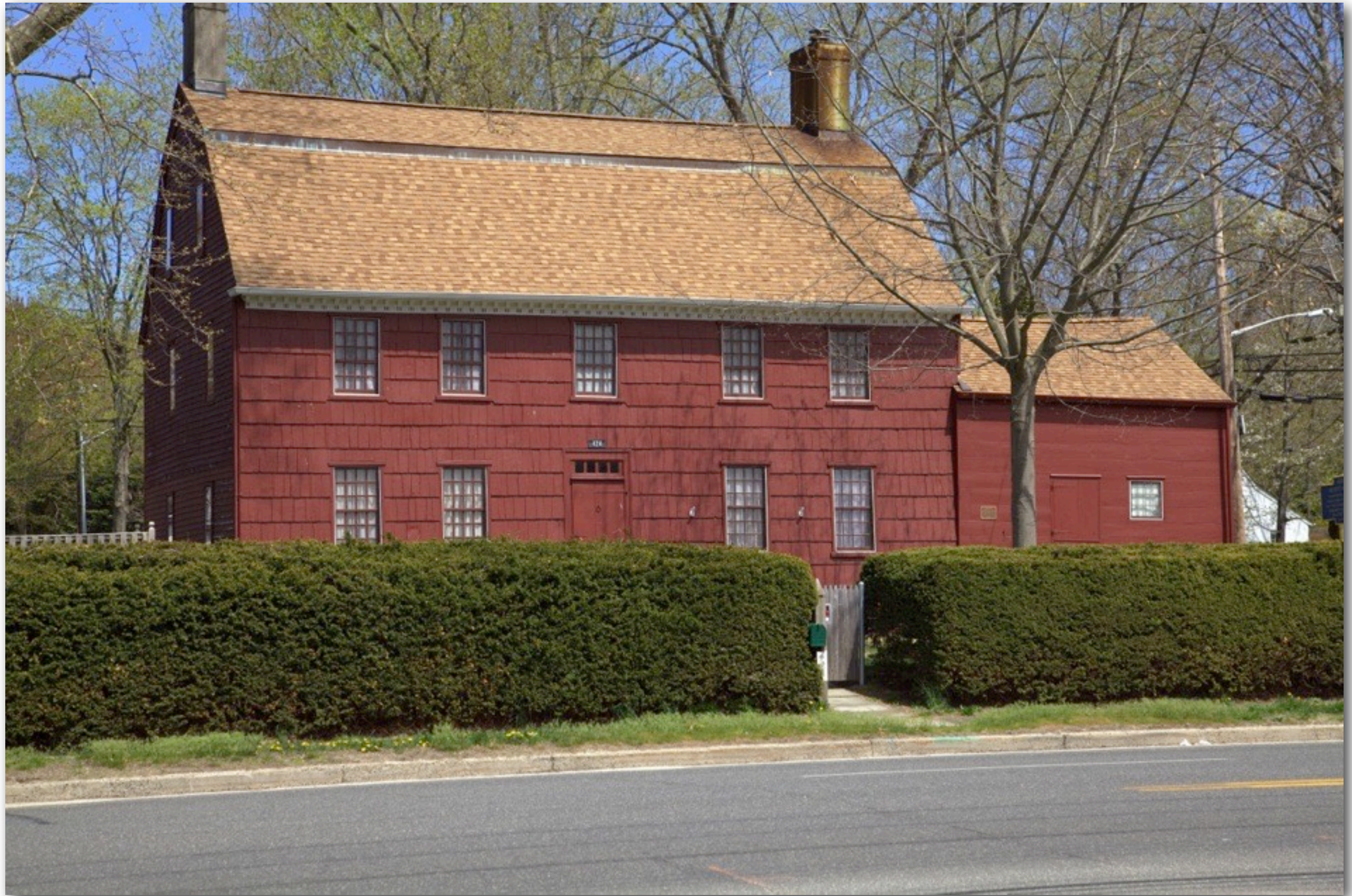
424 Park Avenue - Known as the “oldest house” its height measure from sidewalk to roof is 33'. 5”