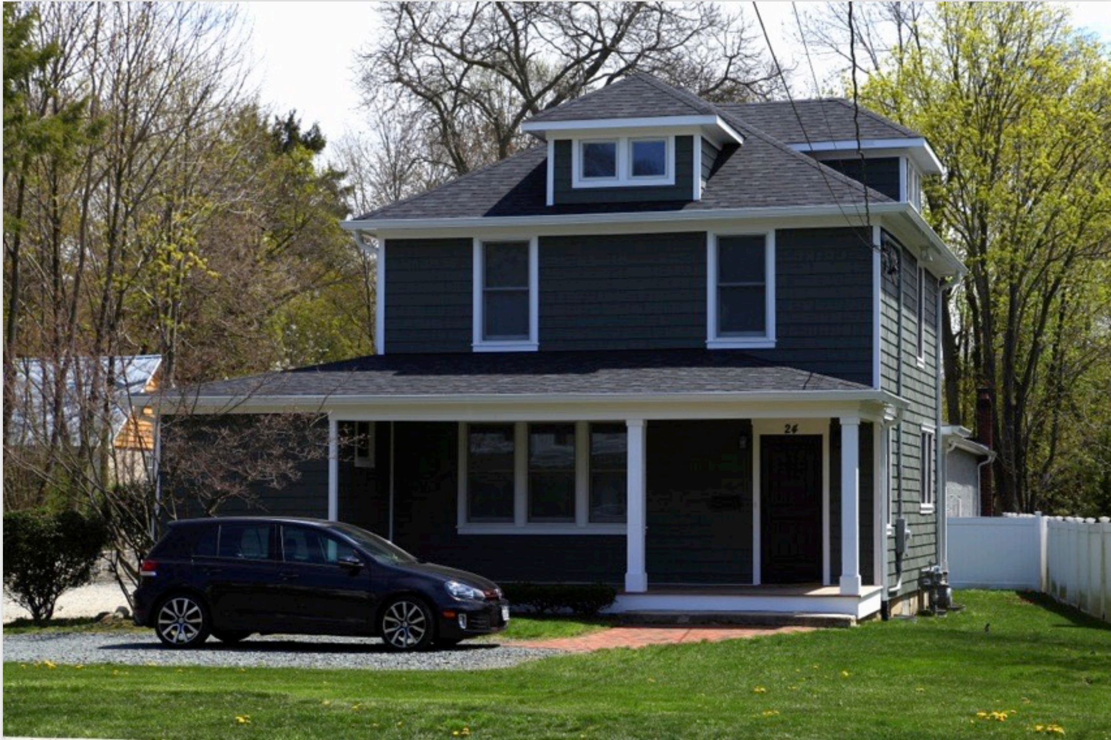
24 Main Street