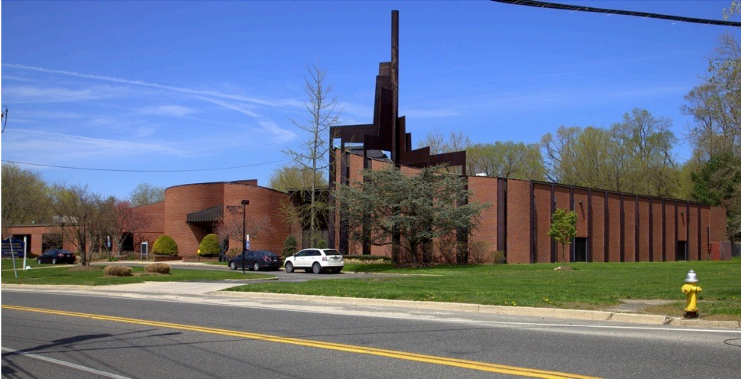
HUNTINGTON JEWISH CENTER - This is clearly a contemporary art deco building located in the Huntington Historical Green