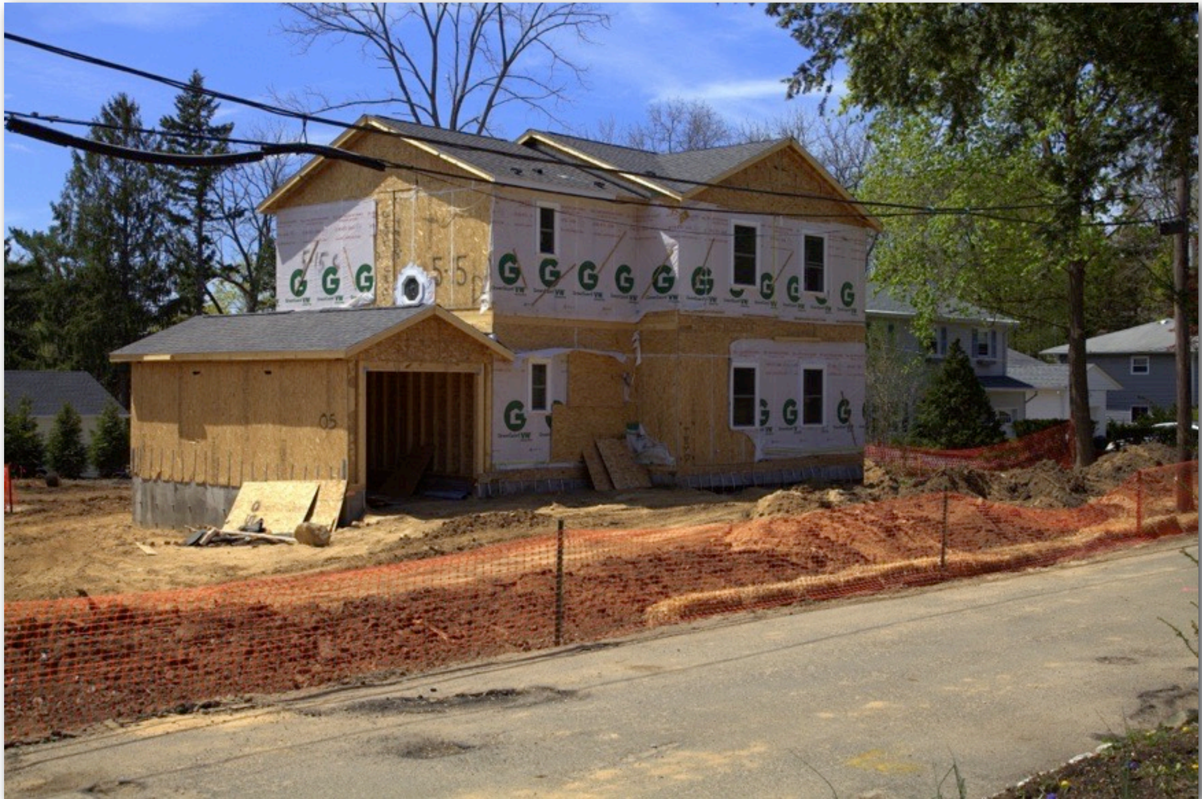
3 Margaret Lane -A New house within historic corridor that is not a salt box style