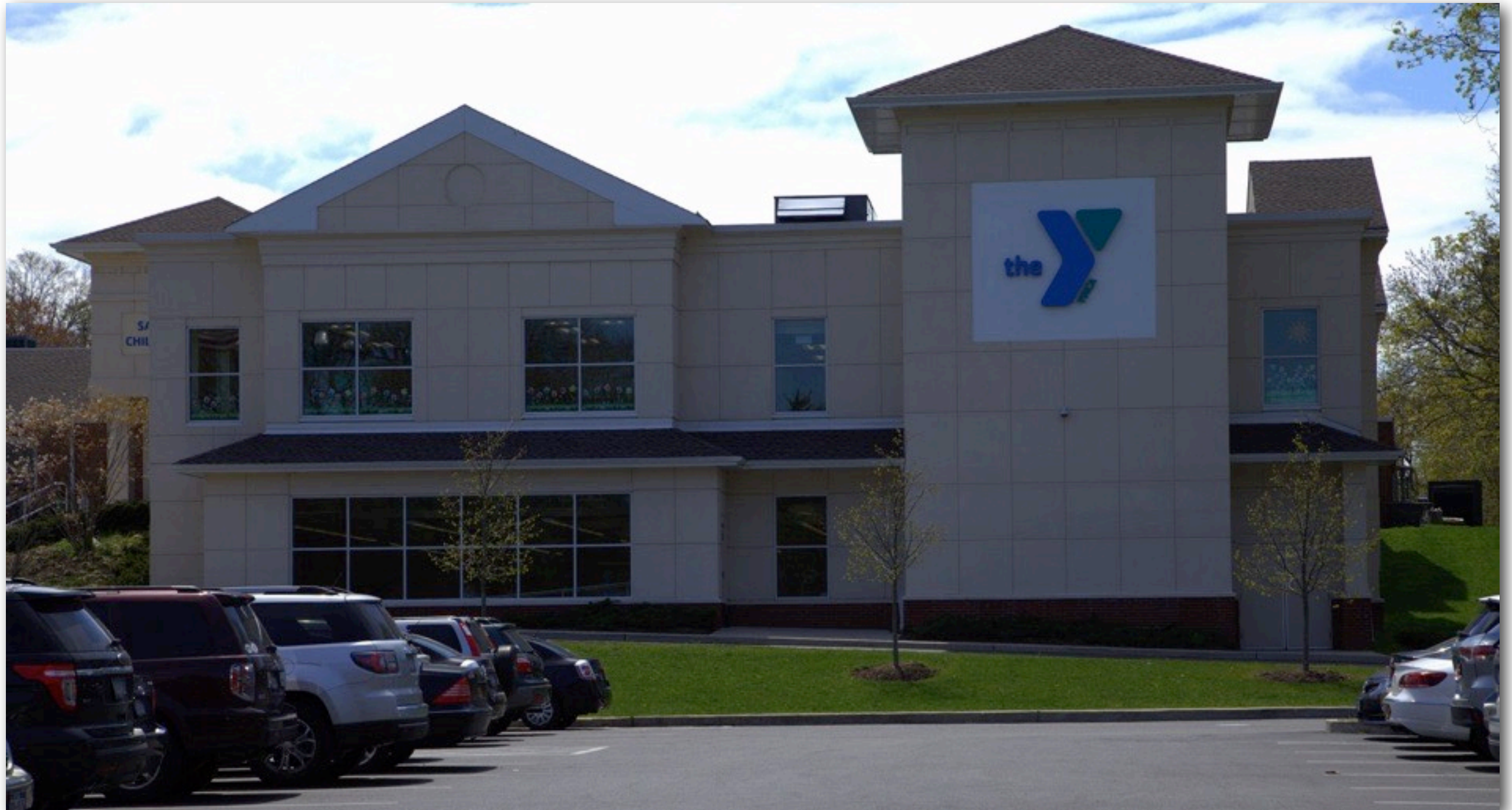
YMCA buildings - stucco style contemporary across the street from proposed Platts's Park Avenue