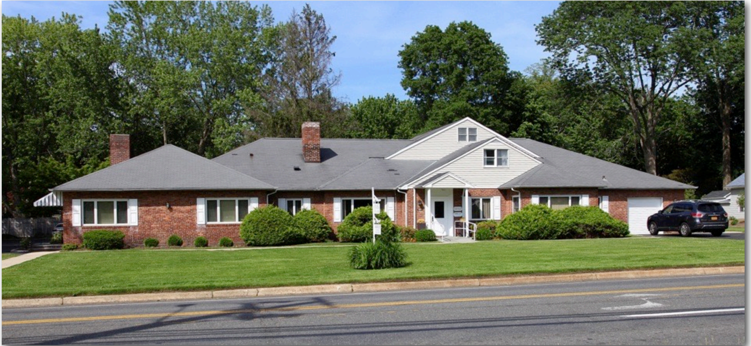
380 Park Avenue & Cannon Court -A medical office that is similar to the width of the Platts's Park Avenue