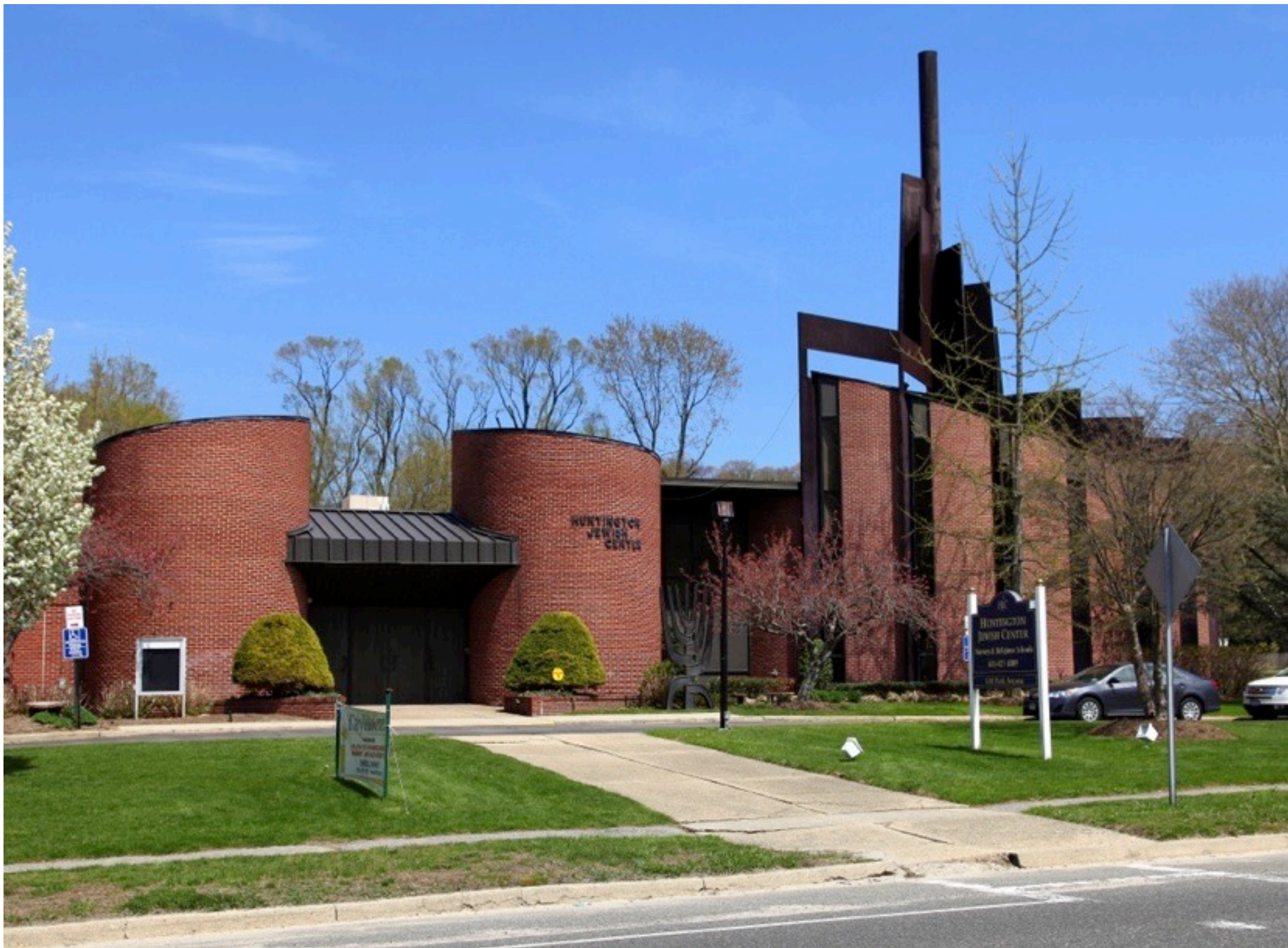
HUNTINGTON JEWISH CENTER - This is clearly a contemporary art deco building located in the Huntington Historical Green