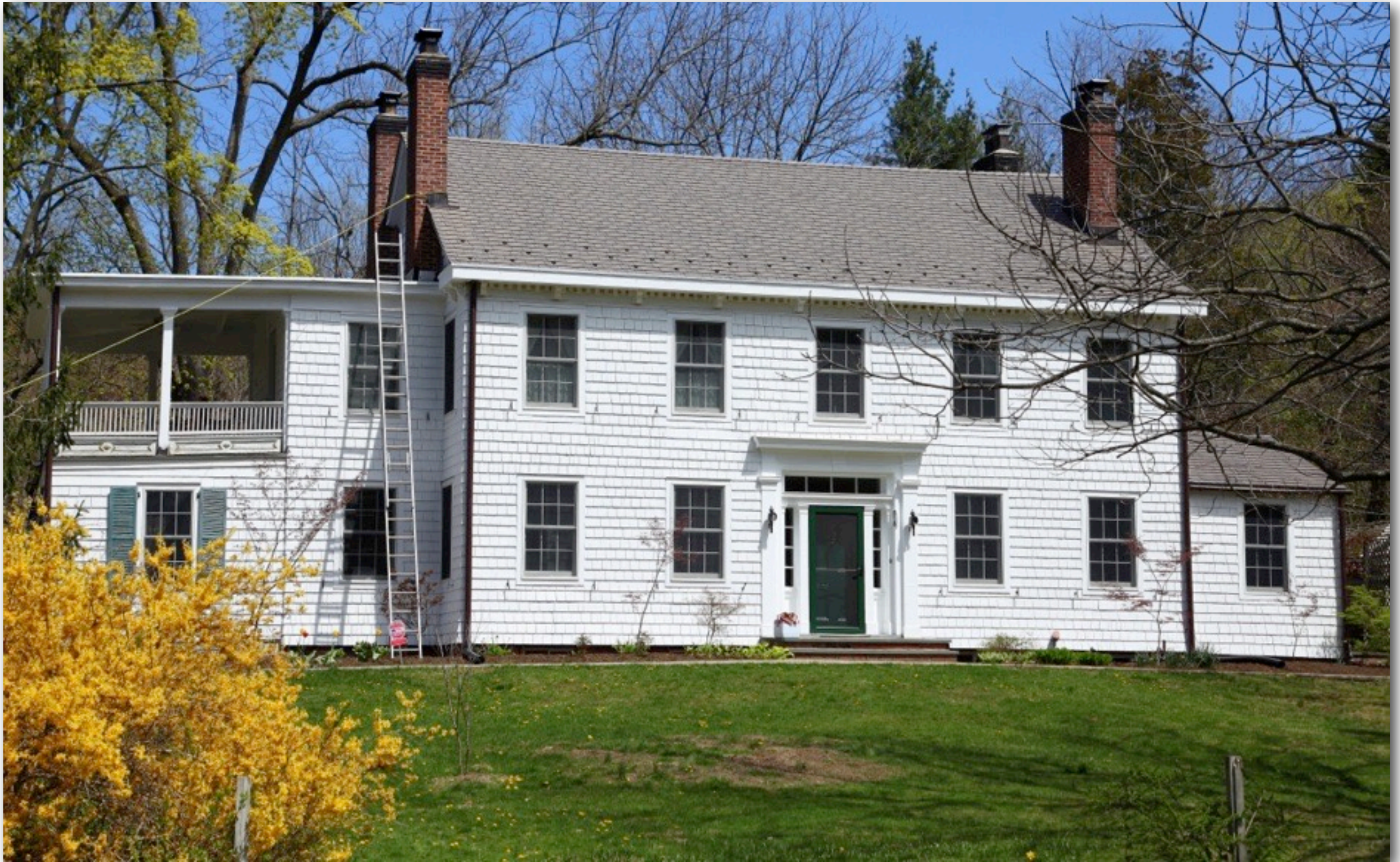
515 Park Ave. 1/4 mile south proposed Platts's Park Avenue