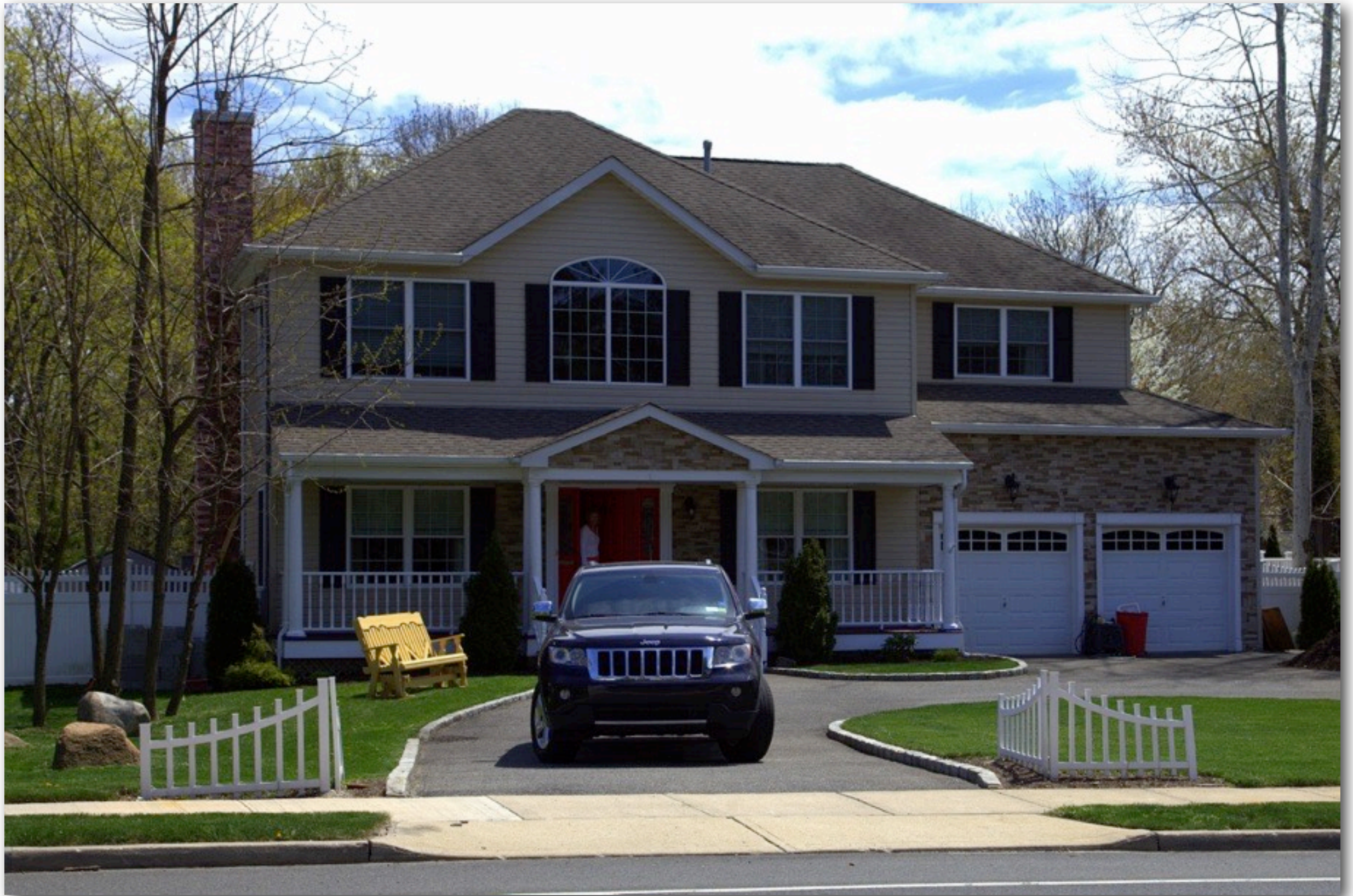
22 Main Street -2 houses east of proposed Platts's Park Avenue colonial in style