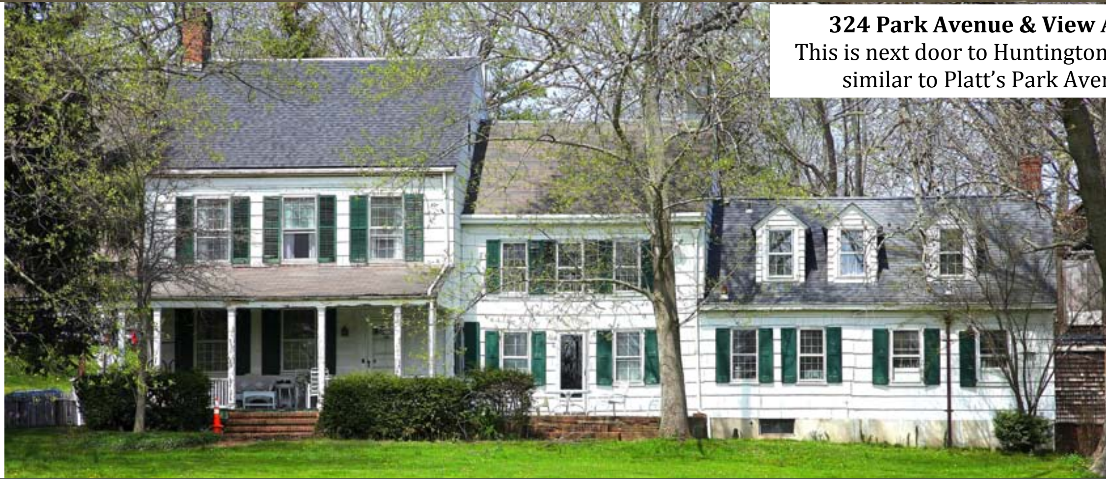
324 Park Avenue & View Acre Drive - This is next door to Huntington Hospital and is similar to Platt's Park Avenue design.