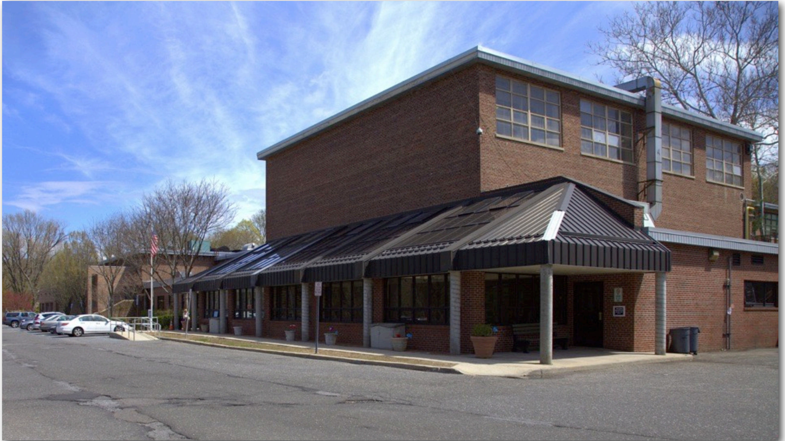
Flanagan Senior Center