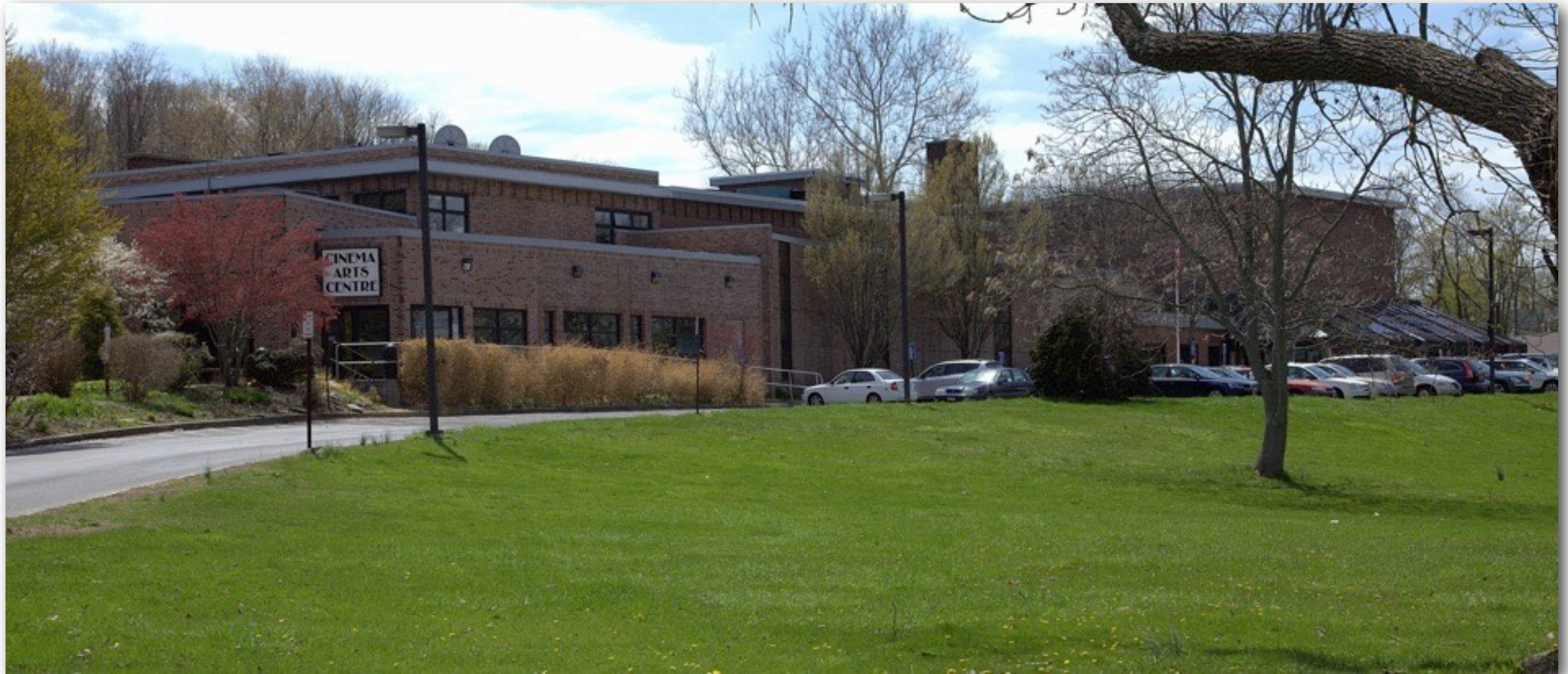
Huntington Cinema Arts Theater - brick structure across from proposed Platts's Park Avenue