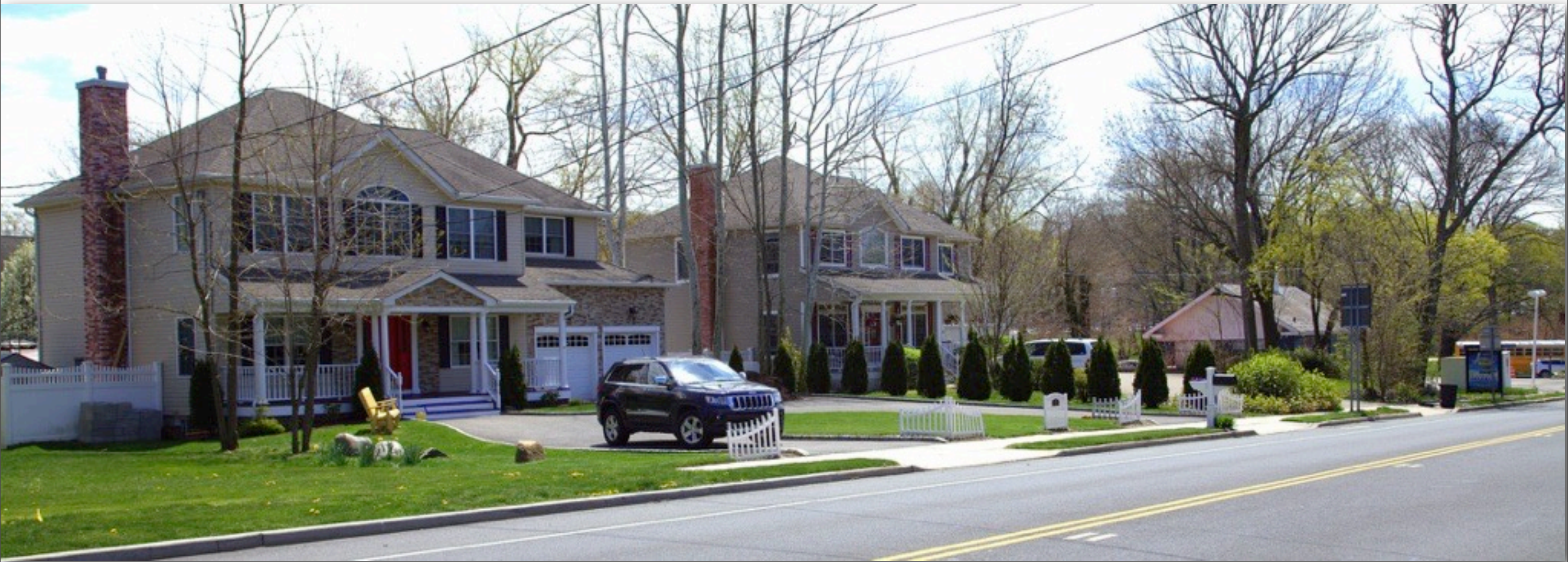
Houses on Main Street - Depicts houses immediately to the east on 25A Main Street